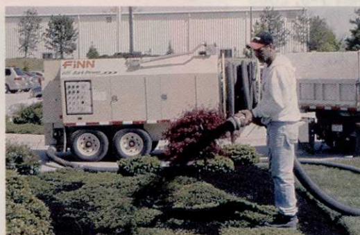
The unit can apply 15 to 30 cubic yards of material per hour.

The FINN Bark Blower aim-and-shoot spreaders take the work out of transporting and installing bulk materials. The pneumatic spreaders come in four models with hoppers sizes of 1.5 (BB-302), 4.5 (BB-906/918), 8.2 (BB-605), or 36 (BB-1240) cubic yards.