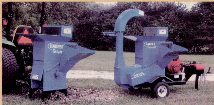
The Goossen Chipper Shredder line

For more information, contact: 877-263-2677 (87-SandBoss).