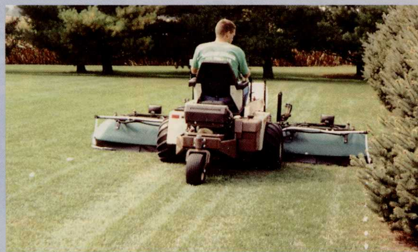
TurfTracker helps eliminate overlapping and streaking.

For more information, contact: 407-343-0256 or www.microtruk.com .