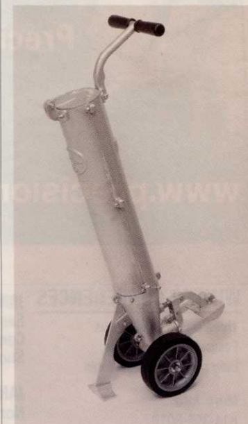
Taylor Pritchard Inc.'s Sand Boss

Taylor Pritchard Inc. has rolled out its new Sand Boss divot-filling device. Using this patented equipment virtually eliminates lower-back fatigue while allowing the controlled, efficient dispensing of divot-fill material. The unit does away with the lifting, carrying and bending associated with the divot-filling process. More than four times faster than the bucket-and-cup method, it takes approximately five minutes to fill 100 divots with the Sand Boss. The aluminum and stainless steel unit features a manually operated valve for the control of dispensed material and a leveling bar to smooth off the filled divot.