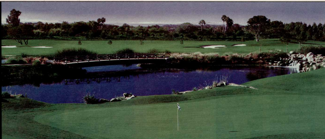
Glen Annie Golf Club • Santa Barbara, CA