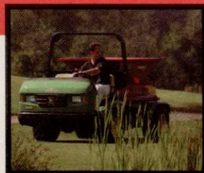
Comes as a tow behind or truck mount