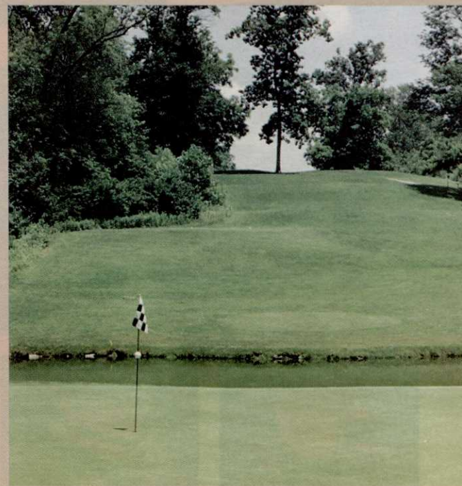
Cincinnati's Glenview Golf Course is one of seven courses Billy Casper Golf began managing for the city on Jan. 1.

Cincinnati Recreation Commission (CRC) with a number of services, including agronomy, marketing and public relations for its Avon Field, California, Dunham, Glenview, Neumann, Reeves and Woodland courses.