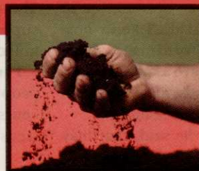
Works great with organics and other materials

The new ProPass from Ty-Crop has the lightest footprint and the most accurate spread pattern on the market. Plus customers can use it to spread a wide variety of materials at different depths and widths!