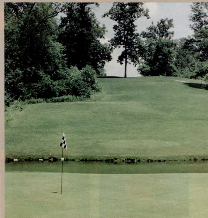
Cincinnati's Glenview Golf Course is one of seven courses Billy Casper Golf began managing for the city on Jan. 1.

Cincinnati Recreation Commission (CRC) with a number of services, including agronomy, marketing and public relations for its Avon Field, California, Dunham, Glenview, Neumann, Reeves and Woodland courses.