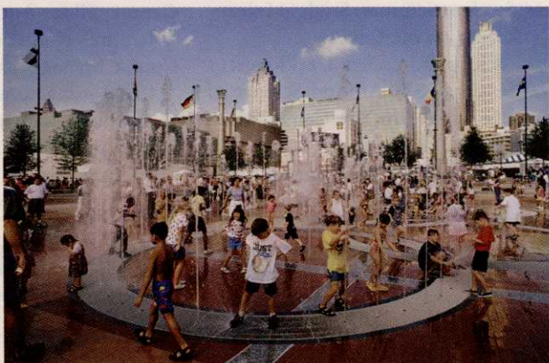
The Fountain of Rings in Atlanta's new Centennial Olympic Park

However, what hasn't changed is Atlanta's sense of history and its world-famous Southern hospitality. Below is a quick look at where to eat and what to do in the South's most cosmopolitan city.