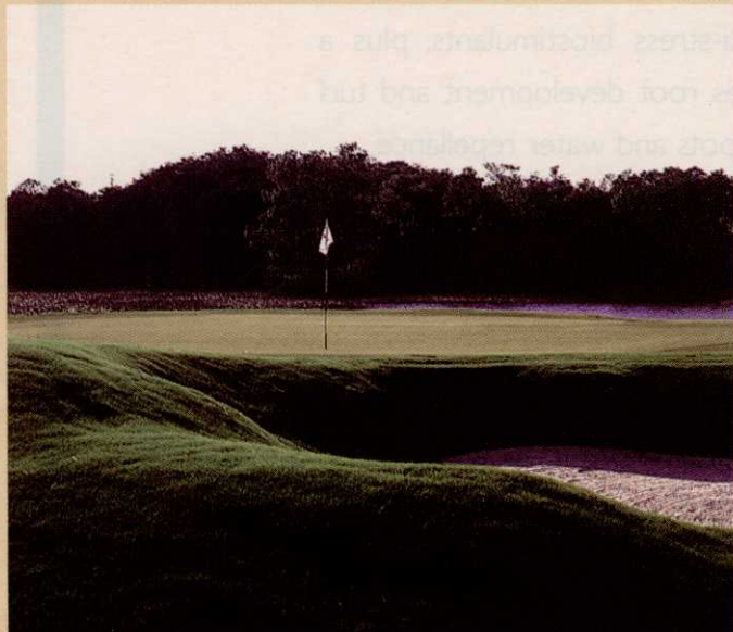
The Arthur Hills-designed Club at Renaissance in Fort Myers, Fla., is one of three Hills courses that opened in Florida in January.