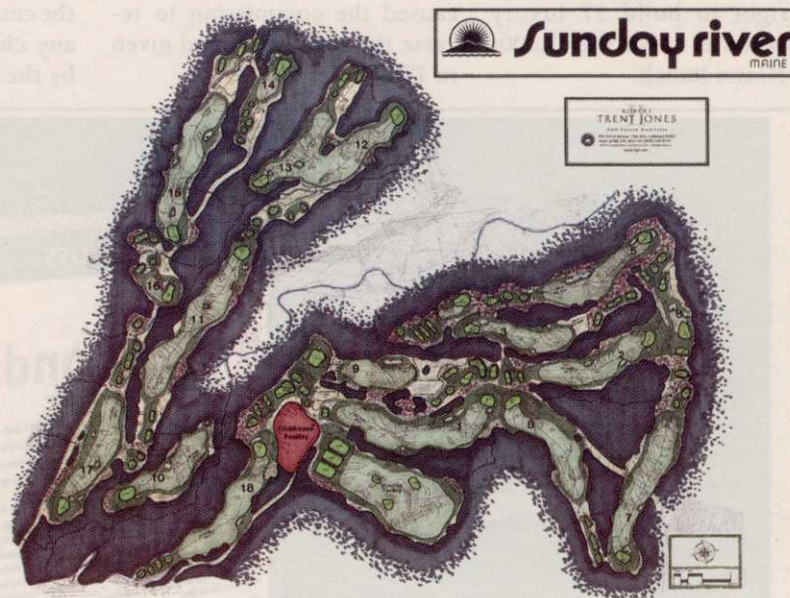
A rendering of the planned course at Sunday River, which was designed by Robert Trent Jones Jr.