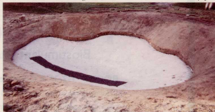
"Smiley" drains are an integral part of the Billy Bunker method.