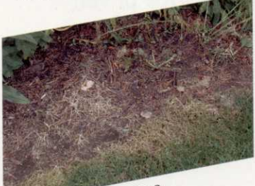
5 days after QuikPRO