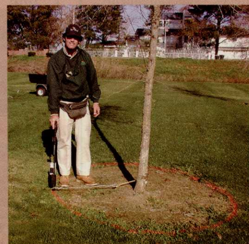
The "dead ringer" gives the spray tech a guide to follow.

It simply consists of a steel hook and a piece of rope with a loop on the end. The steel hook is hooked around the tree and the end of the paint gun goes in the loop. Then all you do is pull the rope tight and pull the trigger as you walk