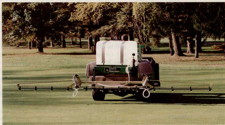
Spraying low amounts of soluble/liquid nitrogen is one of the most popular methods of fertilization.

The second change is the incredible popularity of foliar feeding. This may be the one practice that has led to the use of less nitrogen. Spraying low amounts of nitrogen, with the use of a solubles/liquids, has become one