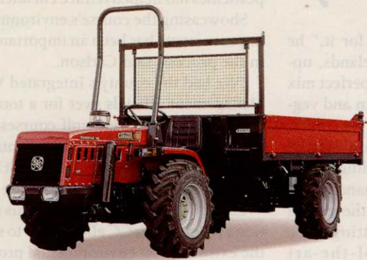
The TigreCar GST77 features three-sided hydraulic dumping

For more information, contact: 888-273-3088.