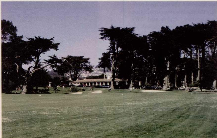
The old clubhouse at Harding Park will be replaced, but in the meantime, the course will operate out of a temporary facility, according to Steve Skinner of KemperSports Management.