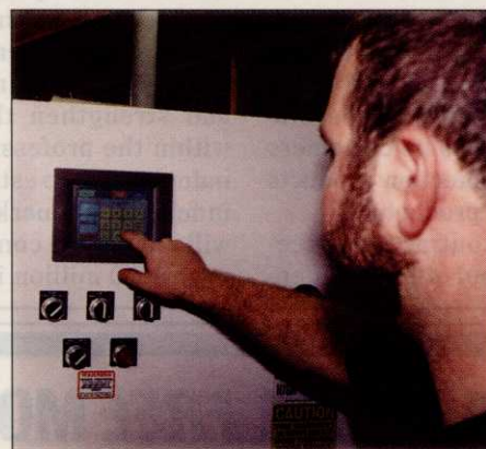
The new Windows-CE powered touch screen

Putting all of the pump stations on a network solves the old problem of having one "master" pump. "Before, if that pump went down, then the other pumps could not communicate with each other," Claas said. "Now if one pump goes down, the others can still communicate and you don't lose the data flow." The system is ideal for