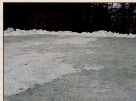
Sunflower seeds and Profile reduce ice buildup

is plowing off the greens and melting the ice layer by applying either Profile soil amendment, black sunflower seeds, or pelletized gypsum and lime. Breaking up the ice allows air exchange and prevents widespread winterkill.