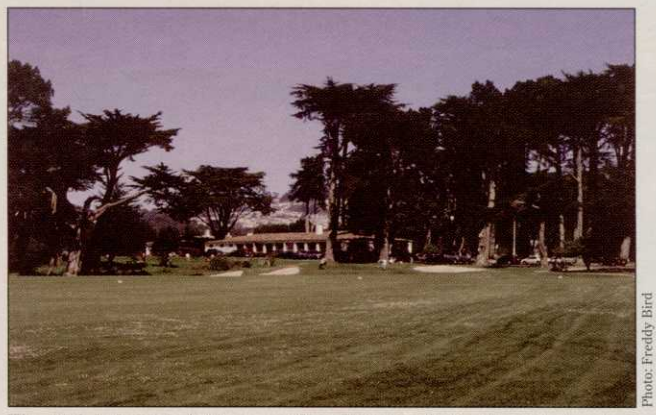
venue that will host The 18th hole and clubhouse at San Francisco's Harding Park, where the 2006 PGA Tour renovations are finally underway after years of delays.

In the past year, new members of the board of supervisors looked