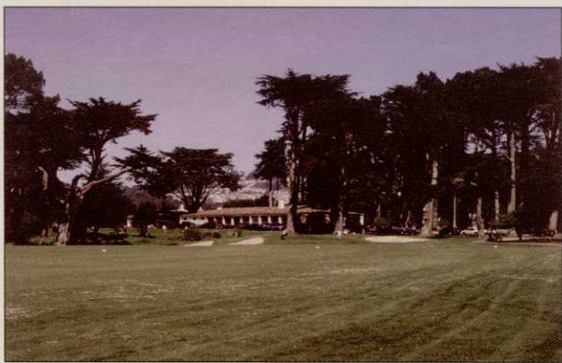
The 18th hole and clubhouse at San Francisco's Harding Park, where renovations are finally underway after years of delays.

In the past year, new members of the board of supervisors looked