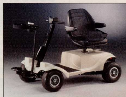
The Spirit weighs in at 330 pounds