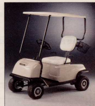
The Single Rider 8000