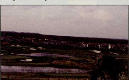
Folsom, Calif.-based Empire Ranch opened in May, seven years after its original planning.

lic golf market in California opened in May after seven years of fits and starts to bring a public venue to one of the last underserved regions of the state. Not surprisingly, the course will be very different from its