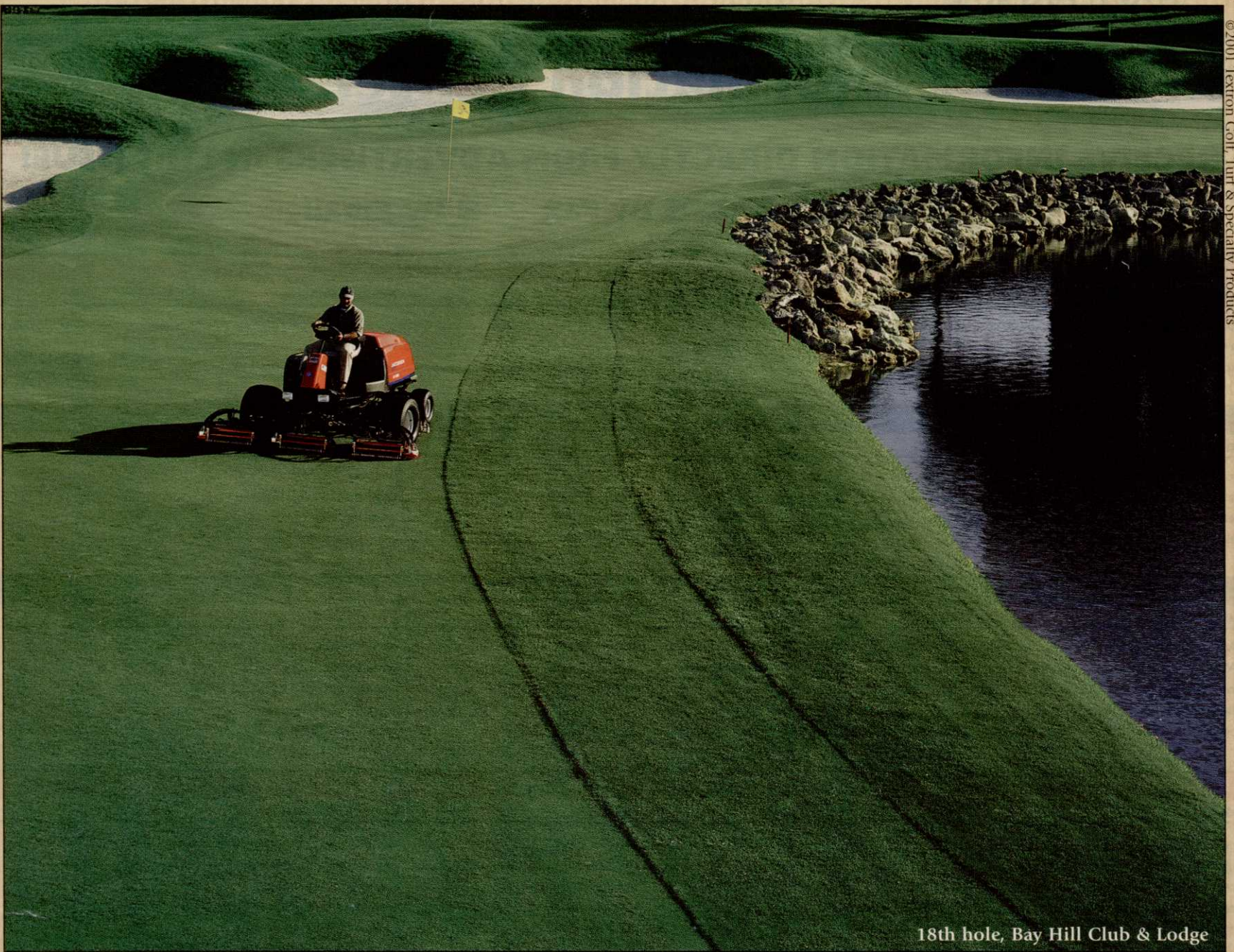
18th hole, Bay Hill Club & Lodge