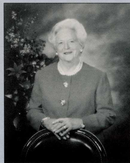
Barbara Bush will be the keynote speaker at the Opening Business Session.