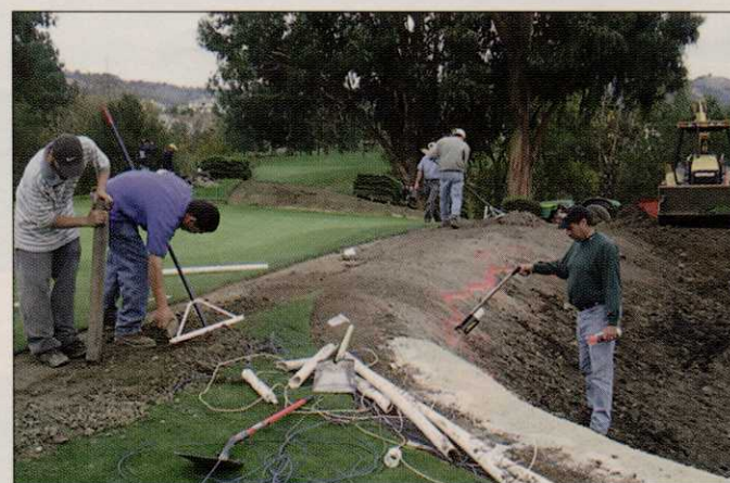
Renovation work is underway at Silver Creek