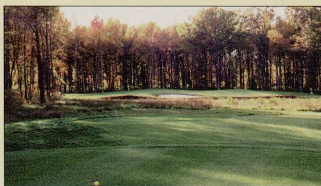
The seventh hole at The Club at Patriot's Glen