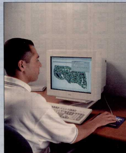
Hunter's Genesis III

For more information, contact: 800-248-6561 or www.HunterIndustries.com.