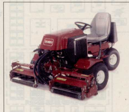
Toro's Reelmaster 2000-D packs more power mowing capabilities on sloped surfaces.

Toro has improved upon the Reelmaster 2300-D with the introduction of the diesel-powered Reelmaster 2000-D triplex mower. The unit is more powerful featuring a 19-hp Briggs & Stratton/Daihatsu engine. The additional power increases traction and