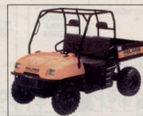
Polaris' UTV has high torque

For more information, contact: 763-542-0500.