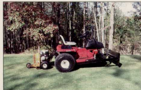
A side view of Balco's converted Billy Goat blower attached to the hydraulic lift of a Toro SandPro

"He had to do some welding and make a few modifications, but we can use the hy-