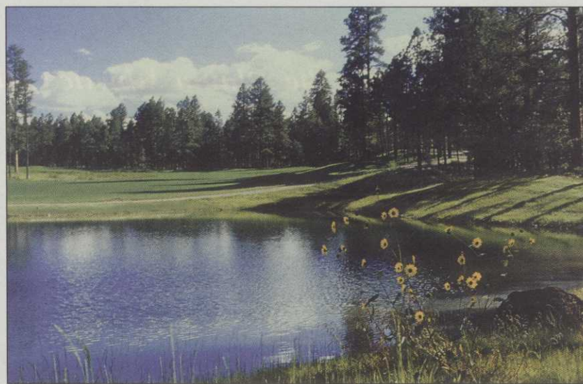
The ninth hole at Von Hagge's Torreon Golf and Country Club