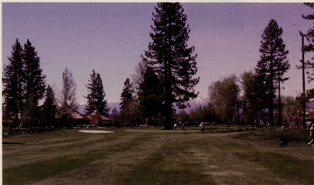
Old Brockway near Lake Tahoe has adopted an organic maintenance program.