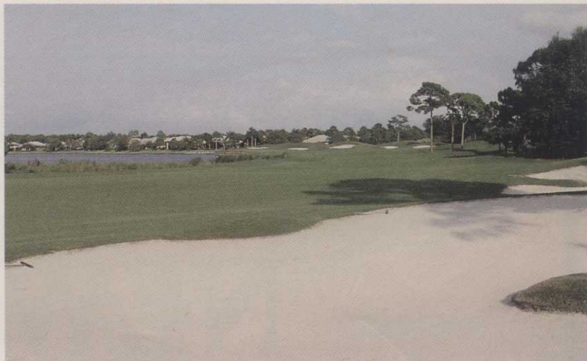
The ninth fairway at the recently reopened Willoughby Golf Club in Stuart, Fla.