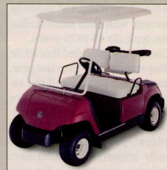
Yamaha's new G-MAX 4-stroke