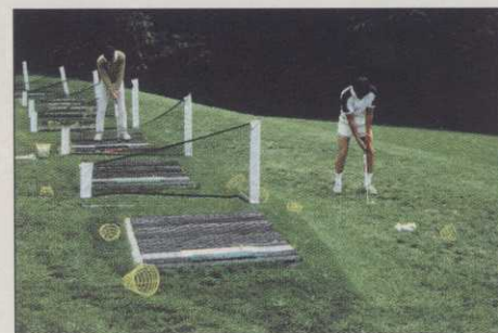
A driving range accident waiting to happen

Effective safety training and risk management programs are not developed overnight. But like it or not, golf course superintendents must consider the tasks of safety training and risk management as the highest priorities within their operations. Zero accidents should be the goal for the entire golf course staff. ■