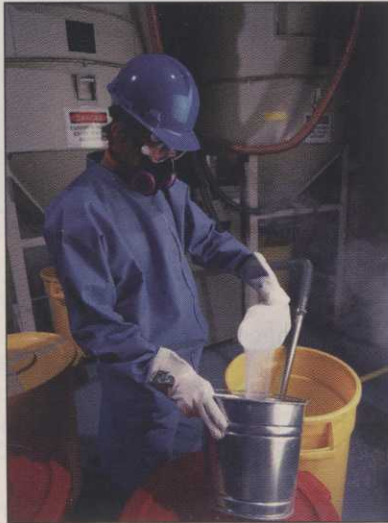
Respirators, gloves and coveralls are essential equipment when handling chemicals