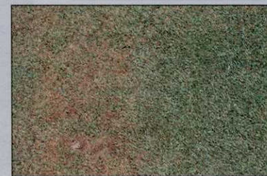
Treated moss (left), and untreated moss (right)