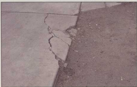
Golf car paths need to be free of trip hazards

• Personal protective equipment must be provided, fitted and used when required. Current Occupational Safety and Health Administration policies could potentially result in heavy fines being imposed on employers who don't follow the requirements to provide workers with hard hats, goggles, fit-tested respirators and safety spray suits, and other protective gear needed for personal protection.