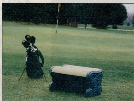
The Bench-Mate can store 100 cans and ice

Cascade products has introduced the Bench-Mate golf course storage bench. The unit, which was designed to be attractive and functional, is made of UV stable polyethylene and can be mounted to the ground. Golf courses can use the Bench-Mate in a variety of ways including: keeping beverages cold during golf outings, storing divot mix material, storing tools and gardening materials, and as a bench to sit on at tee boxes. The bench is 20 inches high, 35 inches wide and 20 inches deep, has a 27-gallon capacity and can store 100 cans and ice.