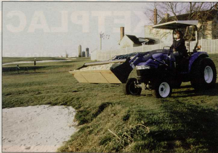
New Holland's TC30 in action

New Holland's new three-cylinder, 30-hp TC30 tractors deliver a wide variety of high-performance features including a choice of transmissions, two- or four-wheel drive or front-wheel drive axle. The 9.6 gpm total system hydraulic flow provides the TC30 with ample power and live hydraulics provides a three-point hitch lift of 1,635 pounds. A separate 3.5 gpm steering pump maintains responsive hydrostatic power-steering, no matter what other hydraulic demands are made. Numerous implements are available including: rotary tillers, front blade, snow blower,