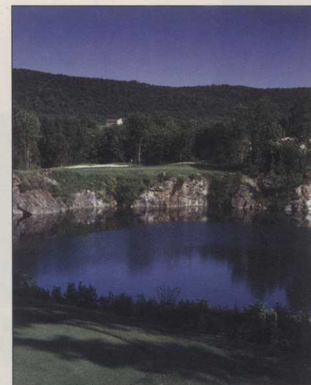
Rulewich's new Wild Turkey Golf Course