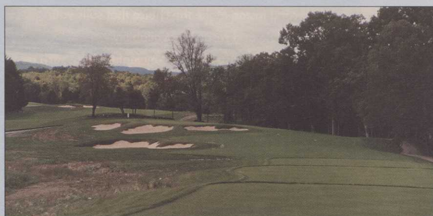
Branton Woods Golf Club in Stormville, N.Y., opened Oct. 8.