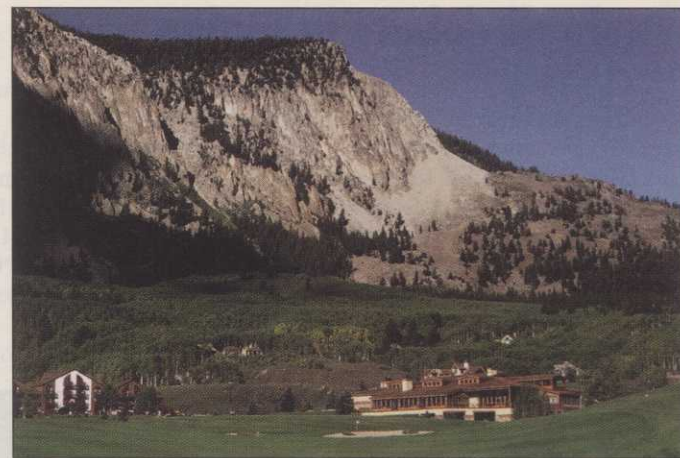
The 18th hole at Crested Butte Golf Club

Crested Butte Golf Club was built in 1982 in this ski town located in the southwest corner of the Colorado Rockies. The 7,208-yard course flows over a massive 520-acre site located at 9,000 feet above sea level. Architect Robert Trent Jones