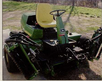
A three- to four-year-old John Deere ProConditioned 3235 fairway mower (left) retails for around $22,000, compared to $36,000 for a brand-new 3235B model. It comes with a one-year warranty.

Sales figures, however, do not tell the whole story. The industry is still learning how to approach the secondary turf market. While high residuals make leasing