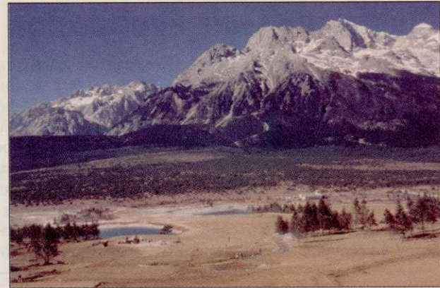
Future site of the 10th hole for the 8,500-yard layout

The town has long been a popular tourist destination for the Chinese and more flights are being added. It is also becoming a destination for Asian tour groups and backpackers, and the developers hope to attract the golfing tourist. In addition to the five-star resort hotel and villas planned for the development, there are several four-star hotels in the area. ■