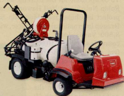
Toro® Multi Pro® 1200 and 1250 sprayers: Featuring the innovative Spray Pro™ control system that directly links flow rate to ground speed ensuring precise application rate.