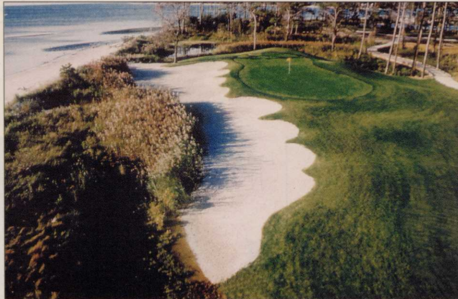
Bay Creek Golf Club, opening June 1, sits at the intersection of Chesapeake Bay and the Atlantic Ocean.

"In the silver program," he said, "Audubon gets involved in the construction. They've got a lot of specs for how you do things and build things. We took their information and added it to the specs for the building contractors. So Palmer Design was involved primarily in changes to the grassing plan. Landscapes Unlimited,