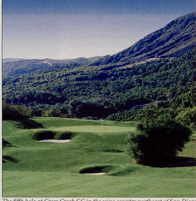
The fifth hole at Cross Creek GC in the wine country northeast of San Diego

"There are big hills on the back nine, with a lot of drama