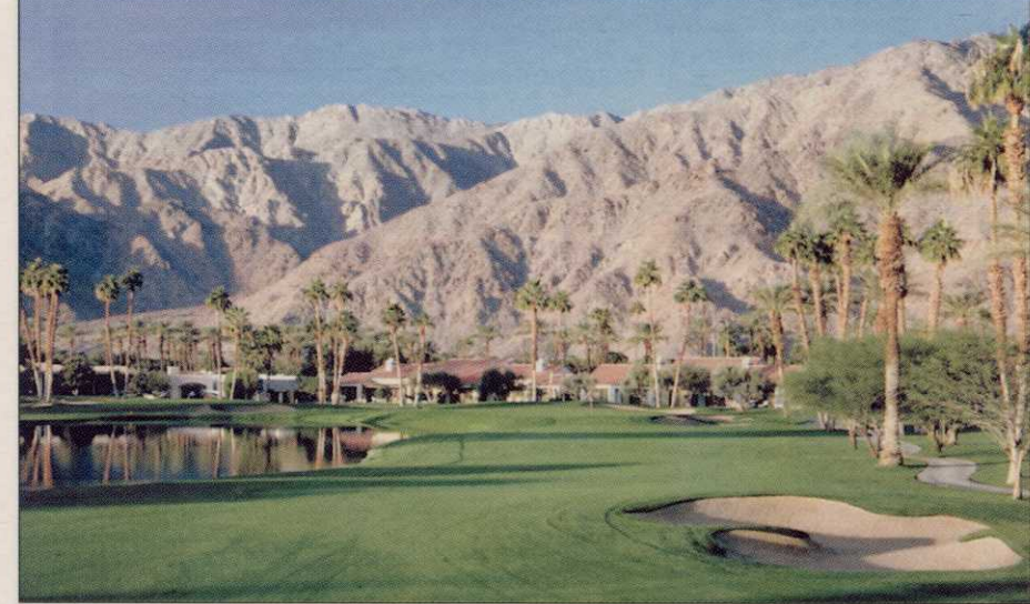
The Graves & Pascuzzo-renovated La Quinta Country Club in California

"The course was designed to reflect the parkland style," said Pascuzzo. Tees were strategically placed on cliffs and rock outcroppings, creating dramatic drives to fairways framed by stands of oaks and sycamores. With elevation changes running about 200 feet, the course offers superb vistas, challenging options and plenty of thrilling shots. According to The Southern California Golfer's Guide, "Maderas promises to deliver golf