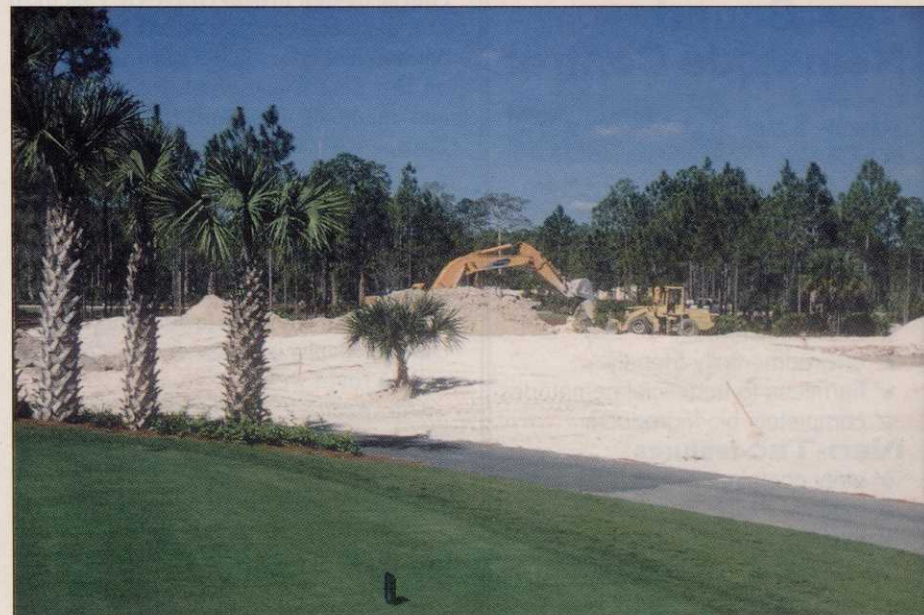
Construction is under way at the North Course at Mediterra.