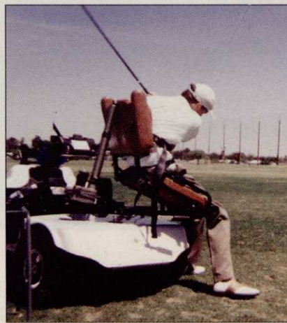
A prototype of Club Car's 1-PASS in action

While the other companies in the market are primarily start-ups or spinoffs from larger mobility scooter concerns, both Club Car and E-Z-GO have formed strategic alliances to get an immediate foothold in the market.