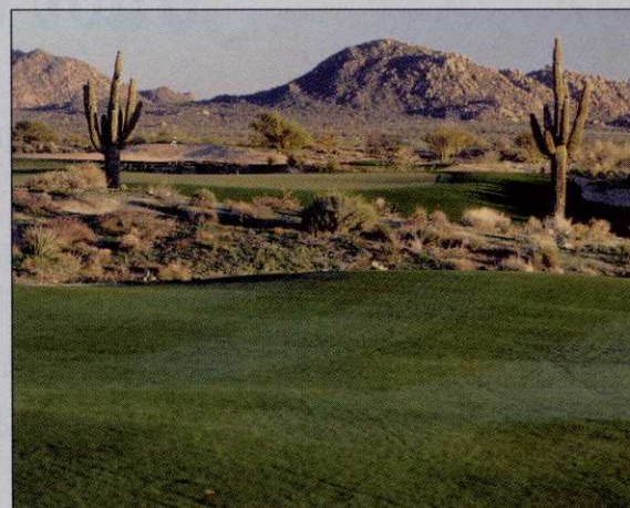
View of Norman's Stonehaven, a course never to be played