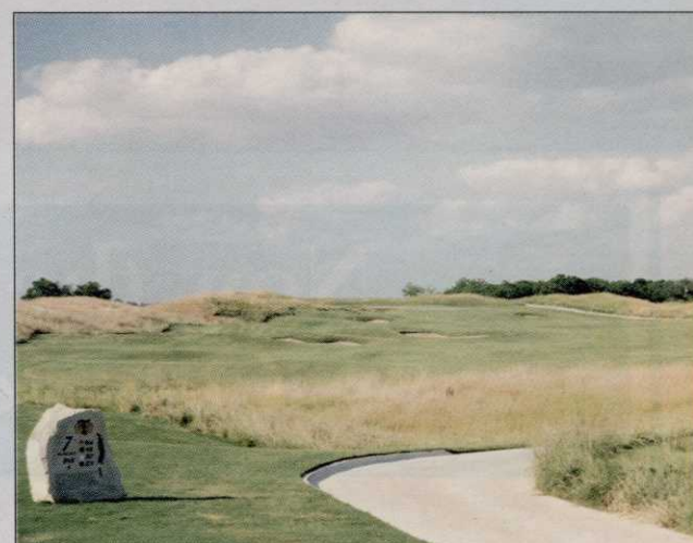
The 7th hole at The Tribute, a 466-yard par-4, is called 'Fin Me Oot'