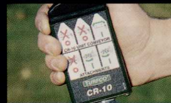
Patent-pending three-position switch makes it easy to handle every CR-10 function.