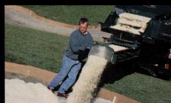
Cross conveyor with swivel action quickly fills bunkers and back fills trenches.

most effective material handler available. Combine these features with the tiltable spinner attachment for a fairway top dresser with unparalleled control over width, depth and angle. For fairway top dressing, construction or renovation projects, make sure you look at the CR-10, the next generation in material handling and top dressing. Call for a demonstration or FREE video.