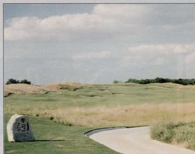
The 7th hole at The Tribute, a 466-yard par-4, is called 'Fin Me Oot'