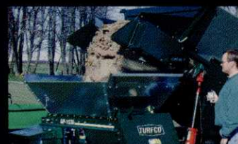
Quickly load top dressers or move material.