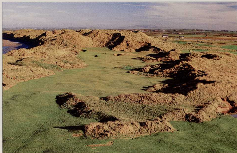
The first hole at Greg Norman's Doonbeg is framed by the dunes.