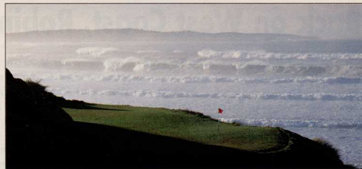
The treacherous 14th hole at Doonbeg sits on Doughmore Bay.