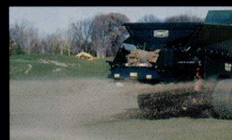
Broadcast top dress from 15' to 40'.