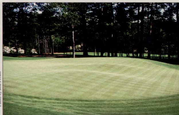
View of green at Augusta National

The immaculate perfection of fairways, and now even a little semi-rough "second cut" along with tees and greens, is as much due to superb management of fertilizers and micronutrients as it is of mowing. Not every other course everywhere