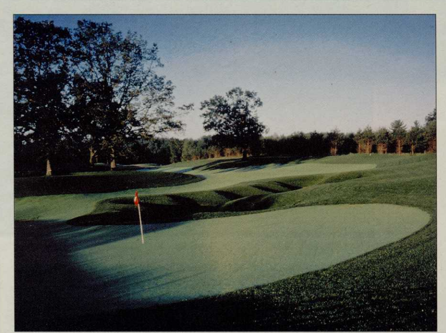
The third green at Tullymore Golf Club