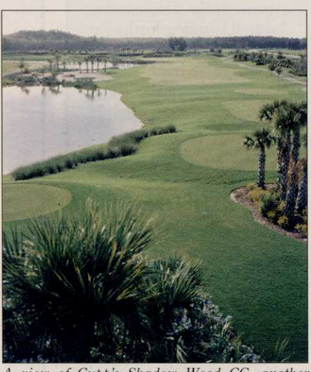
A view of Cupp's Shadow Wood CC, another course he designed for Bonita Bay Group.

Cupp previously designed both 18-hole championship courses at Shadow Wood Country Club in The Brooks, another