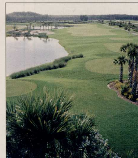
A view of Cupp's Shadow Wood CC, another course he designed for Bonita Bay Group.

Cupp previously designed both 18-hole championship courses at Shadow Wood Country Club in The Brooks, another