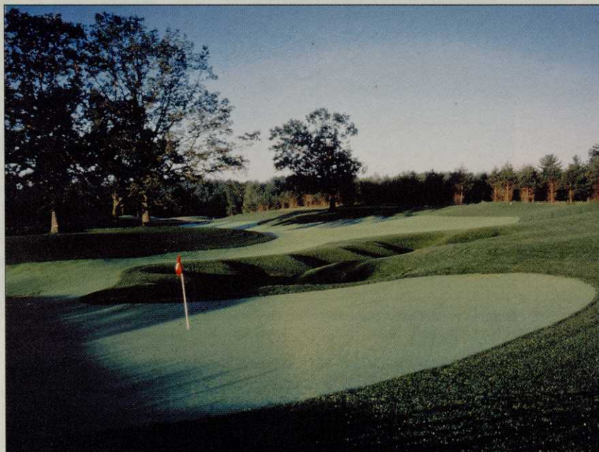
The third green at Tullymore Golf Club