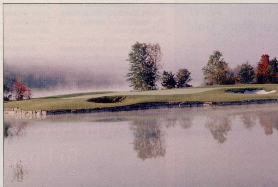
The 15th hole at Saratoga National, on the shores of Lake Lonely

All told, it's a sharp new layout with plenty of interesting features. According to Rulewich, owners and developers Tom Newkirk and Bob Howard spared no expense in building the best course possible.