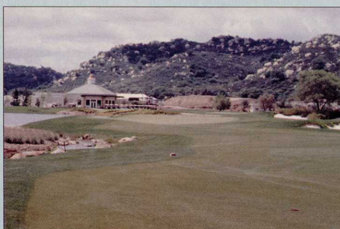
The 18th hole at Barona Creek, with casino site in background