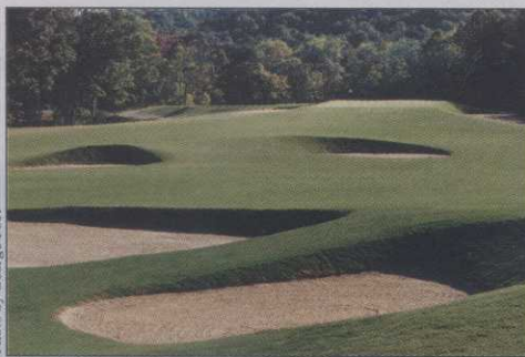
The 16th at Black Creek Club, a 417-yard par-4 known as the "Spine"

there. The bunkers, for example, are certainly retro in their appearance, but it's their placement, their integration into the golf hole and landscape, that influences decision-making. That's what Raynor did so well, and that's what we've done at Black Creek."