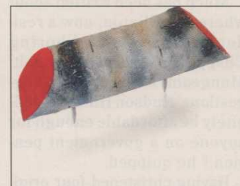
Par Aide's new Branch Tee Marker

The Banded Tee Markers allow courses to use one color marker for a simple and professional design. Tee locations can