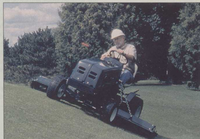
National Mower's Hydrostatic Triplex Mower in action