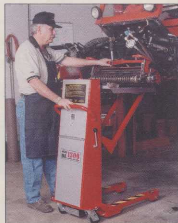
Trion's DL 1300

Equipped with a 20-hp engine and producing 6,600 pounds of digging force, the TMX has a digging depth of eight feet. The unit has an independent hydrostatic drive system and features low ground pressure and a zero turning radius capability that allows for maneuverability without causing turf damage. For more information, contact 262-965-3681.