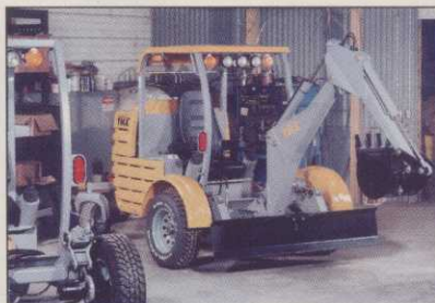
The Lineman TMX is towable

For more information, contact 888-907-3463 or www.nationalmower.com .