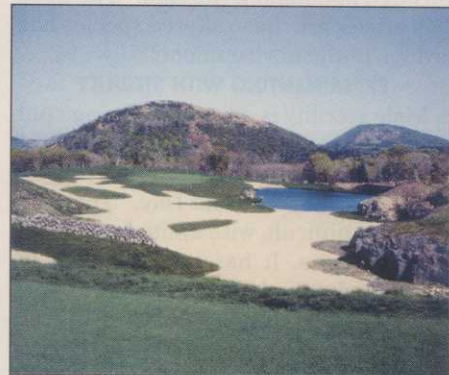
Fream's seventh hole at Nine Bridges

"very impressed" by the par-72, 18-hole course, which runs to a championship length of 7,200 yards and down to 5,250 from the front pegs. The scenery is "amazing" around the site, said Fream, who noted that volcanic outcroppings line the several creeks that cross the property. The entire island is volcanic.