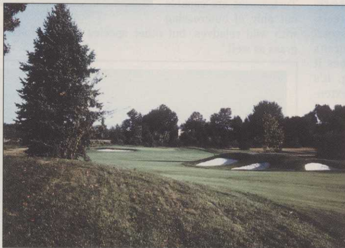
Number 14 at Mungeam's Charleston Springs course, in New Jersey, opening this fall

The club shut its doors in 1982 and today the course site is totally overgrown.