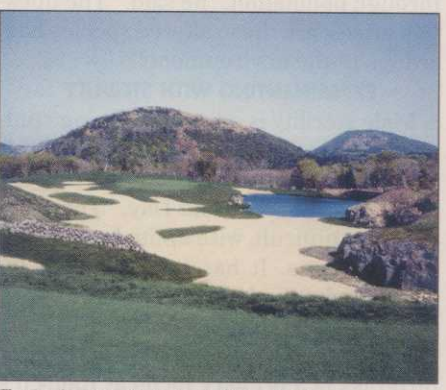
Fream's seventh hole at Nine Bridges

"very impressed" by the par-72, 18-hole course, which runs to a championship length of 7,200 yards and down to 5,250 from the front pegs. The scenery is "amazing" around the site, said Fream, who noted that volcanic outcroppings line the several creeks that cross the property. The entire island is volcanic.