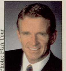
Tim Finchem