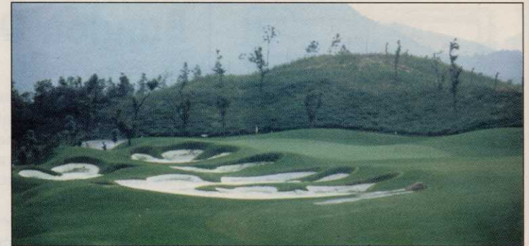
The 12th hole on the Schmidt-Curley-designed ‘B’ course at Agile G&CC

Both the second and third holes play over the lake, offering up a stern test for golfers at the start of the round. The tee shot on the 189-yard par-3 second hole requires a solid carry over the