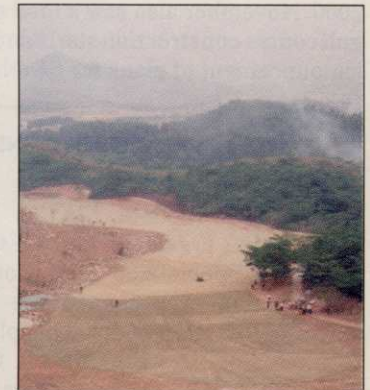
The view from the 4th tee at the Schmidt-Curley/Ernie Els course at Mission Hills