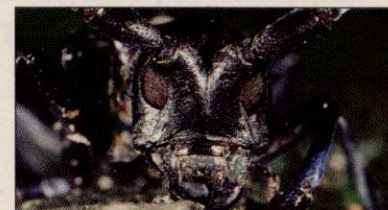
The Asian Longhorned Beetle