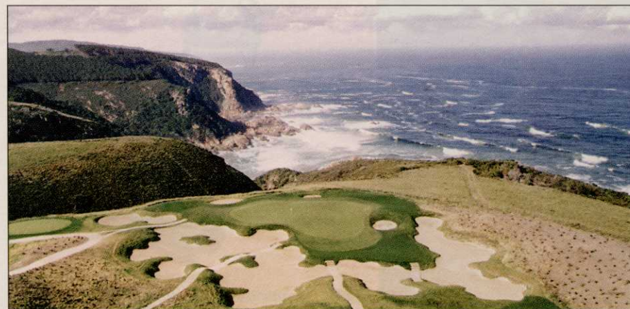
The 14th and 15th holes at Sparrebosch play along oceanside cliffs.