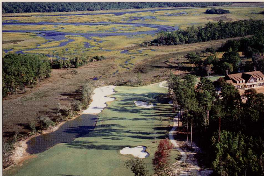
An aerial view of Tom Fazio's new Daniel Island layout

Then comes number 15, which is downright barbaric — a 244-yard par-3, with a pond to carry if you're to even get close to the green. Even the middle-tee player